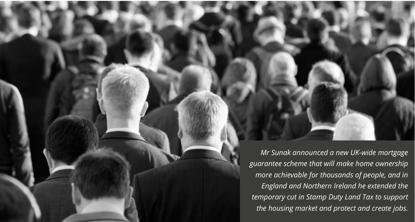
Mr Sunak announced a new UK-wide mortgage guarantee scheme that will make home ownership more achievable for thousands of people, and in England and Northern Ireland he extended the temporary cut in Stamp Duty Land Tax to support the housing market and protect and create jobs.

The new one-off Restart Grants will give businesses further certainty in order to plan ahead and safely begin trading again over the coming months. The government is also increasing support for traineeships and apprenticeships to help people looking for work. Where certain measures do not apply UK-wide, the devolved administrations will continue to receive funding through the Barnett formula in the usual way. ◀